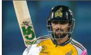
ninth T20 century as captain, the most by any skipper in the format. He went past South Africa's Faf du Plessis, who previously held the record with eight hundreds. The elite list also includes India's Virat

Kohli, who is fourth with five centuries as captain. Babar also drew level with Kohli and Abhishek Sharma for the most T20 centuries in a single country. While Kohli and