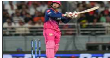
you go to, you will see one name, the same aura, the same love for him everywhere," Sharma, who played with Dhoni for India and CSK, said on Cricbuzz. "And now, the second person I've seen like this is one who, across all ten franchises, whichever ground you walk into, the commentators standing there, the cameramen, the players from the opposition side-they all try to have a

"There are two such players... before this, there was one player, Mahendra Singh Dhoni, for whom, no matter which of the ten franchises or which of the ten grounds