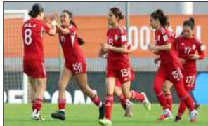
tion. Announcing the decision, FIFA president Gianni Infantino said the amendment would allow Afghan female players, including members of the FIFA-supported Afghan Women United squad, to represent their country in official competitions, in

The decision marks a major breakthrough for players who have been sidelined since the Taliban's return to power in 2021, effectively halting the activities of the national women's team. The move aims to ensure athletes are not excluded from international football due to circumstances beyond their control, in line with FIFA's principles of inclusion and non-discrimina-