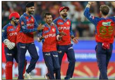
polling arrangements. The counting of votes will take place on May 4. Speaking to reporters after casting his vote in the second phase of the West Bengal Assembly elections, Ganguly also reflected on the competitive nature of the IPL 2026 season. "IPL is going on. There are sev-

Authorities have deployed security personnel to ensure peaceful voting, while election officials are closely monitoring turnout and