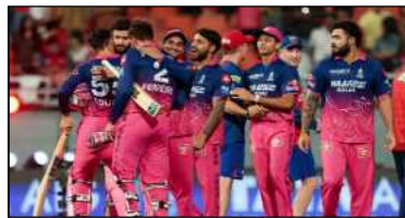
relentless pressure. Calm, calculated, and clean in execution, they saw RR home with ease, handing PBKS their first defeat of the season.

Arsheep Singh was taken apart for three boundaries in one over, while Marco Jansen held a four and a six as the duo maintained