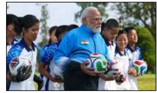
advocated for football's growth in South Asia, reposted the images on Instagram, writing: "Great to see @narendramodiplay our beautiful sport. Football truly unites the world."

"Nothing like playing some football with my young friends in Sikkim on a lovely Gangtok morning!" Modi wrote, alongside images from the session. In a follow-up post, he added, "Clearly, an energising football session with these youngsters!" Infantino, who has long