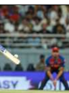
of the hardest things to do, because you don't know if you're playing. So mentally, he is exceptionally skillful to be able to keep that focus and go and bring the game to us. He went in at a tough position," Sangakkara told reporters after the match. "Riyan Parag's small innings was exactly what we needed to bring the momentum back over here. So it was a collective effort," he added. Earlier in the chase, 15-year-old sensation Vaibhav Sooryavanshi provided a blistering start with 43 off 16 balls, while Yashasvi Jaiswal chipped in with a fluent 51. Despite a brief slowdown triggered by Yuzvendra Chahal's strikes, RR stayed in contention before their finishers took charge.

Rajasthan Royals (RR) head coach Kumar Sangakkara heaped praise on finisher Shubham Dubey for his mental strength and match awareness after the left-hander played a match-winning knock of 31 runs, coming as an impact player against Punjab Kings (PBKS) in their first defeat of the season. "I thought Dubey, coming in as an impact player, is one